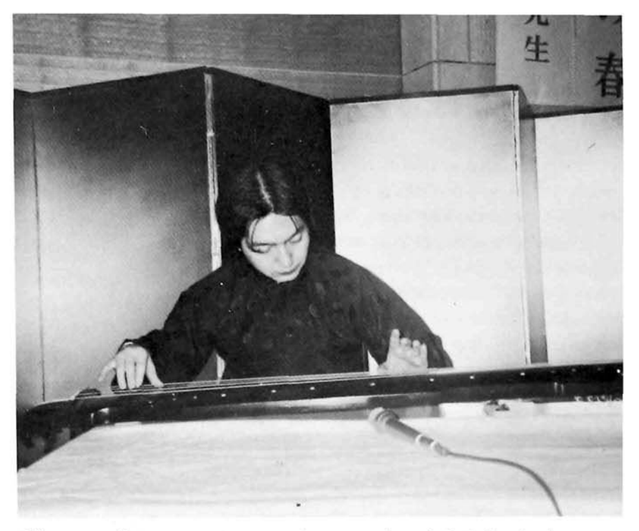
Chin, an ancient Chinese instrument, became popular again in the last decade.

od but a scholar by the name of Chen Yang compiled an impressive encyclopedia of music, which became the first of its kind in Chinese history. Another notable development of the Song Dynasty was the popularization of solo instrumental music, especially Chin and Pipa.