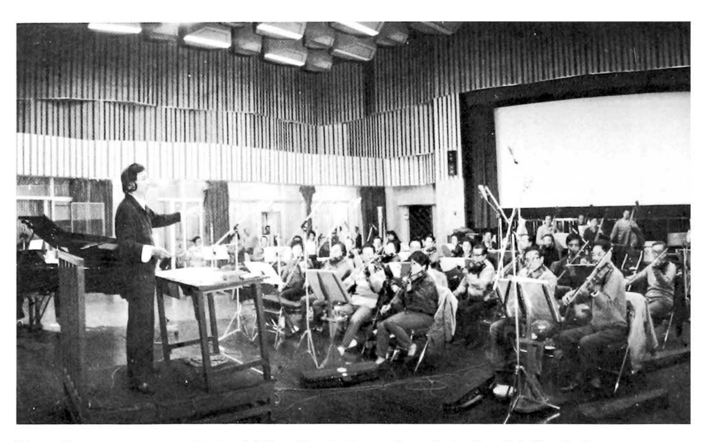
The newly-built recording studio for dubbing film background music in Shanghai Film Studio.

lines, triadic arpeggios, and sequential motifs were the inevitable results.