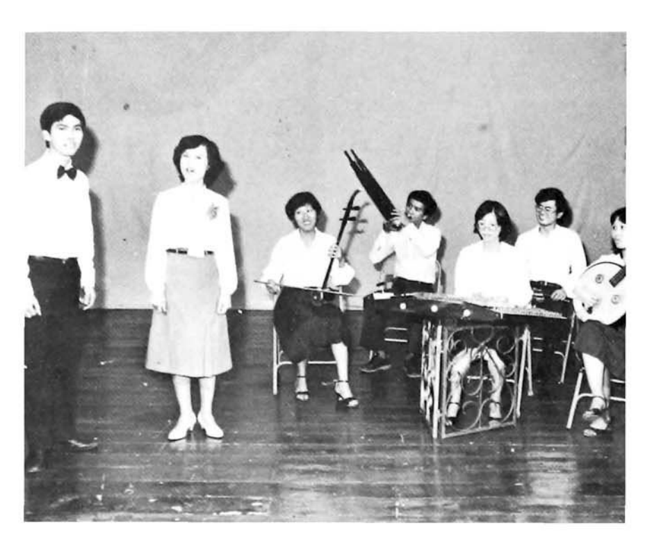
Amateur musicians and singers performing in a concert in the 80s.

Movement started as a student protest movement against the invasion of western economic and political powers. The angry students who saw in the failures of their elders, the corruption and weakness of the Confucian cultural heritage, were searching for a new world outlook. Later the 'May Fourth Movement' became a patriotic movement of a national scale, calling for the dissolution of corrupted goverment, the innovation in science and technology, the practice of democracy, educational reforms, anti-Confucianism and the creation of a new Chinese culture. During this period of cultural challenge, music educators, musicians and composers were inevitably involved in such a national movement.