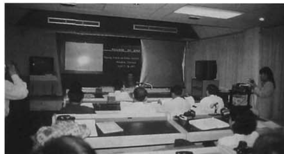
Workshop at SPAFA

The Workshop helped participants to better understand the assay techniques for the identification of tool making materials, and thus appreciate the hominid technology of making tools. It also oriented participants to the different type concepts and scheme of classification of lithic tools.