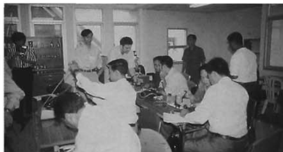
Laboratory at SPAFA

I n co-ordination with the University of Tubingen, Germany, and University of Silpakorn, Thailand, SPAFA organised a Workshop on Lithic Analysis between April 2nd and 22nd, 1997. For two weeks, seventeen participants from SPAFA's member Southeast Asian countries were involved in learning and sharing, with actual experience, archaeological tool analysis and excavation activities. Many of the trainees, who were Heads of unit/department/or institution conducting archaeological field research and/or exploration, contributed reports on their respective countries.