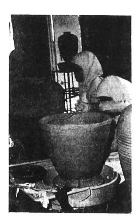
Photos show a few of the many traditional handicrafts produced by Malay artisans.