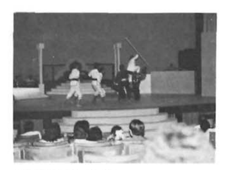
Fighting the giant.

network in 1976. There was almost a total absence of public stage shows of drama during that period except for an odd number of presentations made by secondary school and college students, done on a small scale and limited to student audience.