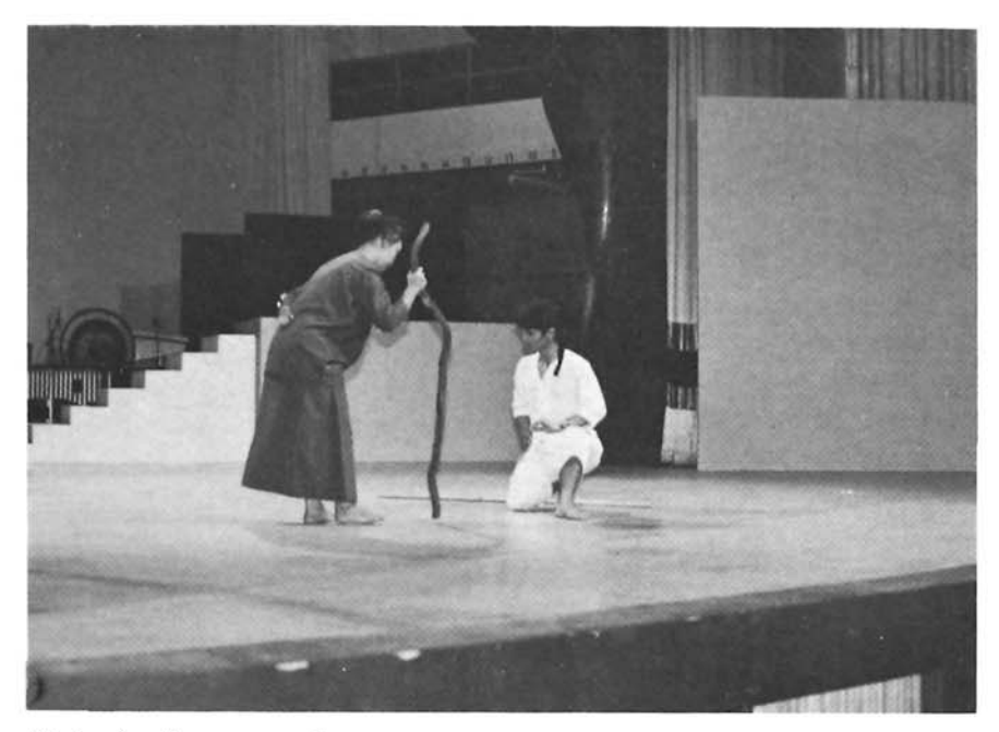
Advice for the young prince.

If the above fact is still doubtful, let us move to the period of traditional medicine, when man was often influenced by his physical and spiritual needs. We, in Brunei Darussalam, are rich with unique traditions. Our forebears used to treat ailments through ritual methods. "Bahantu" rites were carried out to call in spirits, to help cure sick people. There were also rituals to worship the beach and serve the Anchak.