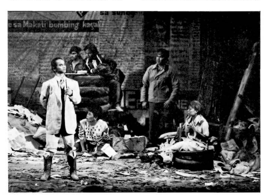
"The Trial of Mr. Serapio" by the students from Cebu was received enthusiastically by the Singaporean audience.

The following day, on the fourth of October, the Thais presented