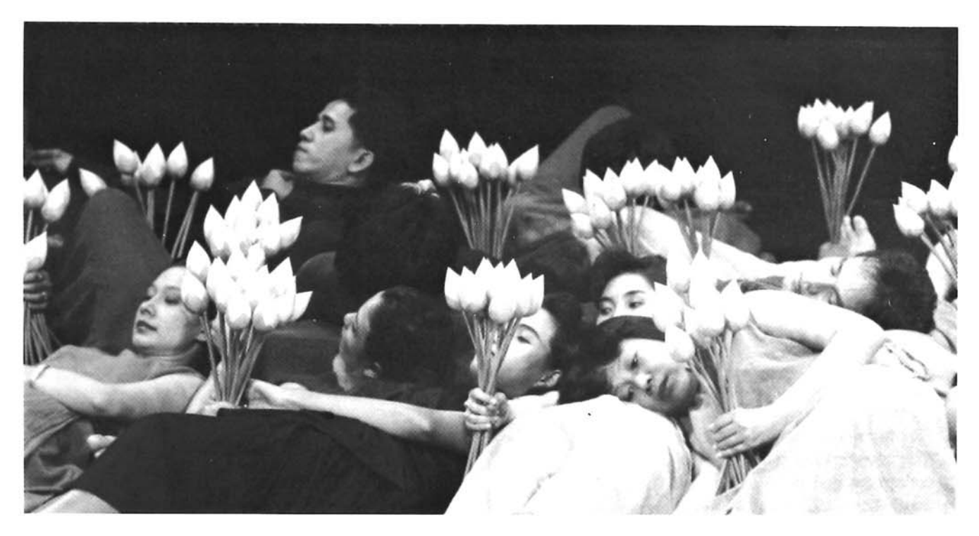
Thai dancers performing with their lotus flowers at the ASEAN Dance Festival, 1990.

sean, the Association of Southeast Asian Nations (Brunei Darussalam, Indonesia, Malaysia, Philippines, Singapore and Thailand), was formed on 8 August 1967. Through its Committee of Culture and Information (COCI), it organizes numerous activities and projects in Literature, Performing Arts and Visual Arts. Funded by the ASEAN Cultural Fund, it aims to promote