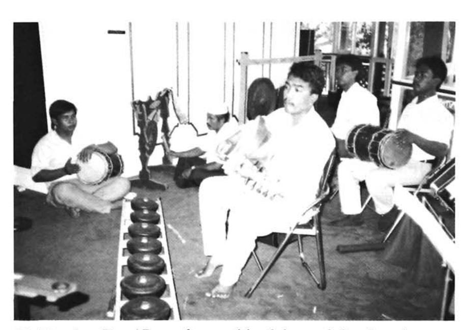
Musicians from Brunei Darussalam practicing their songs before the performance.

The play chosen by Brunei Darussalam was a story of patriotism and romance. It was set against the warring backdrop of Spanish insurgence and the occupation of Brunei in 1578 A.D. With stylized movement and elaborate costumes, the production was fair on the whole. Although the pace was a bit slow, the cast did give a polished and truthful performance. It was a pity that the group