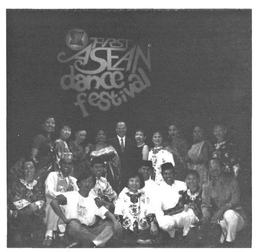
Delegates from Singapore at the closing ceremony of the ASEAN Festival for 1990.

The plotless dance was supported by an atmosphere which suited the four different sections of the dance. They were: the rural setting, which represented the harmony, the urban, which represented the conflict, the uthopian arena, where the previous sections assimilated and finally,