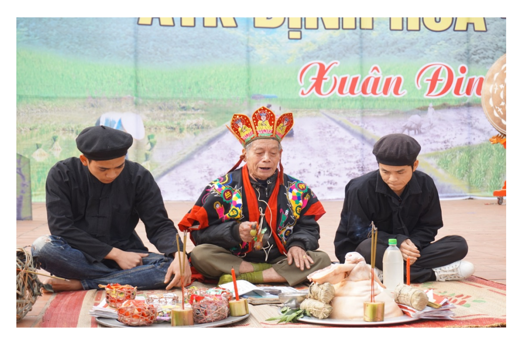
Figure 5. Offerings in the rite of San Chí people, Định Hóa district, Thái Nguyên province

invite villagers to eat their food offerings. The family that has more people coming to eat is believed to have a good crop that year.