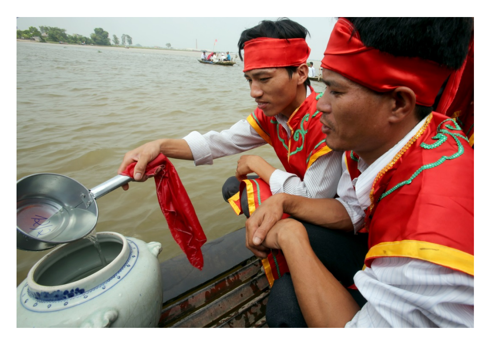
Figure 2. A rite in a water procession at Độc Bộ Temple, Yên Nhân commune, Ý Yên district, Nam Định province

symbolic game as well as a rite in this ritual. Vietnamese farmers believe that the higher the kite flies, the more beautiful the weather. It is the sign that the gods accept human prayers.