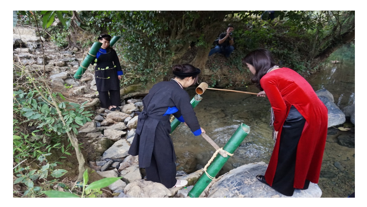
Figure 3. Picking sacred water at Dội Well, starting Đuổm Temple's Festival, Phú Lương district, Thái Nguyên province

Figure 2. A rite in a water procession at Độc Bộ Temple, Yên Nhân commune, Ý Yên district, Nam Định province