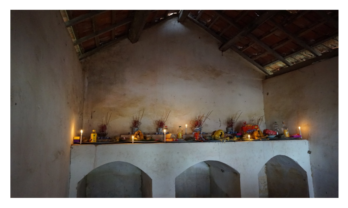
Figure 4. Offerings in the Ooc Pò of Nùng people, Đồng Hỷ district, Thái Nguyên province

For example, in the festival of Và-Ngự Dội temples, there is the rite of Tản Viên Saint (god of mountain) procession from Và Temple in Sơn Tây district, Hanoi City at the midnight to Ngự Dội Temple in Vĩnh Tường district, Vĩnh Phúc province. Specifically, this procession crosses the Red River (the border between two provinces) to pick up water in the early morning. After worshipping at Ngự Dội Temple, the throne of Tản Viên Saint and the holy water are moved back to Và Temple.