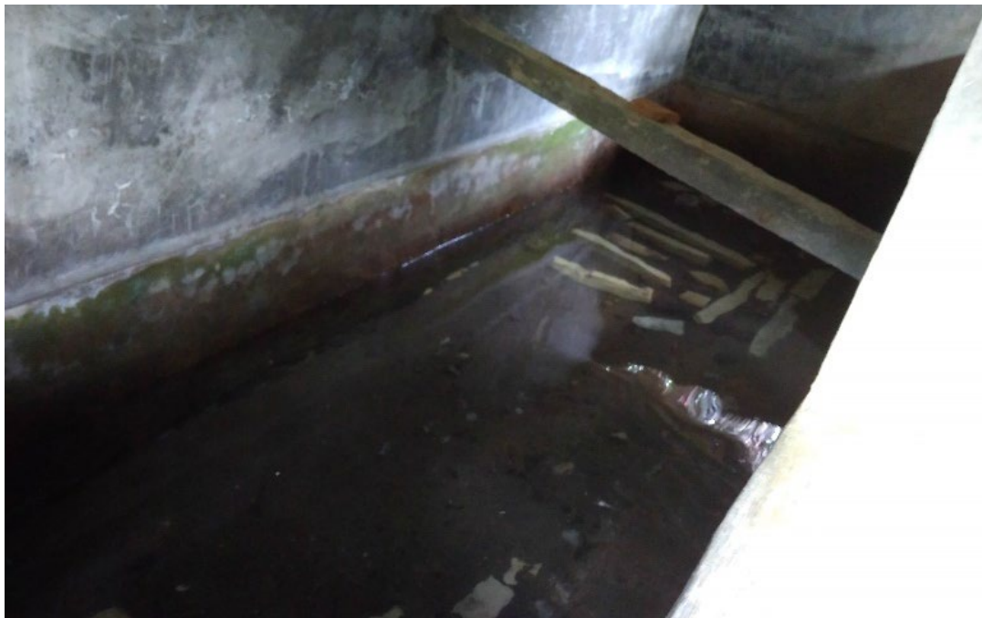
Fig. 2 Sendhang Milodo, which is believed to be the residence of Mbok Roro Pithi, ancestral residents of Dusun Tukluk, Tambakromo Village.

Evidence for a religious and belief system is shown by the procession of all elements of society in following the tradition of taking water from the Sendhang Milodo. This part of the procession is powerful because the village head and members of local leadership follow the procession. This section begins with welcoming the arrival of the village head and local leaders at the Bale Dusun Tukluk (Tukluk Sub-Village Hall) in Tambakromo Village. After arriving in front of the Tukluk