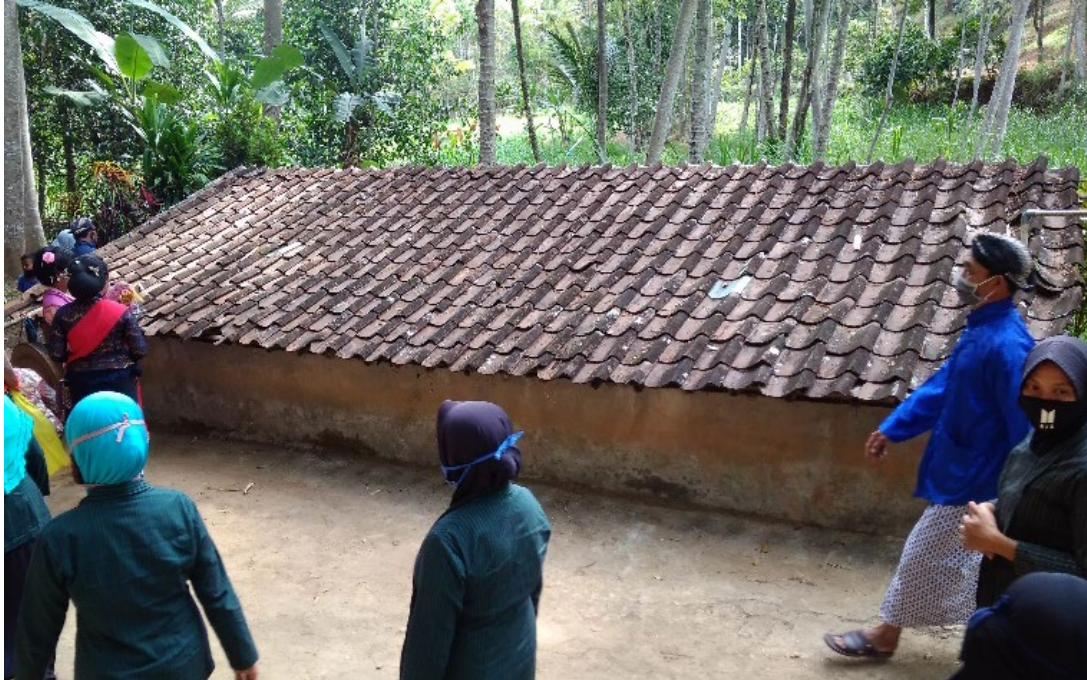
Fig. 1 A building in which there is a groundwater source named Sendhang Milodo. 'Source: Photo by R. M. Pramutomo, 2020.'