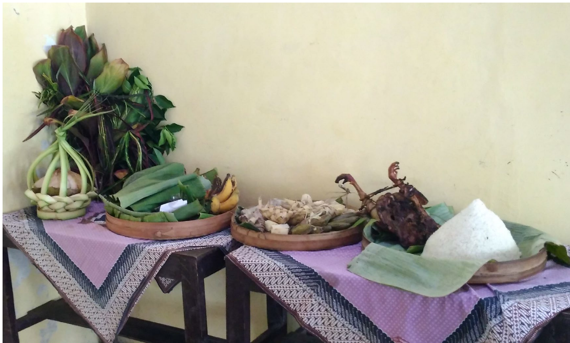
Fig. 3 The main offerings in the Village Purification ritual which is placed in the Bale Dusun Tukluk, Tambakromo Village.

Sub-Village Hall, the Tukluk Sub-Village Head welcomed the Village Head and all local leaders who were then asked to sit in the Bale Dusun. There are two types of offerings placed in this area. The main offerings are inside the Bale Dusun (Figure 3), while the supporting offerings are in front of the Bale Dusun terrace. Based on an interview with Sadimo 2 , the primary function of offerings for the community is a means to give offerings to their ancestors. In this case an offering to Mbok Roro Pithi as the ancestor of the Dusun Tukluk community, Tambakromo Village. Supporting offerings function as a form of gratitude to the sendhang as a source of water on which the villagers live (Sadimo interview 8 October 2020).