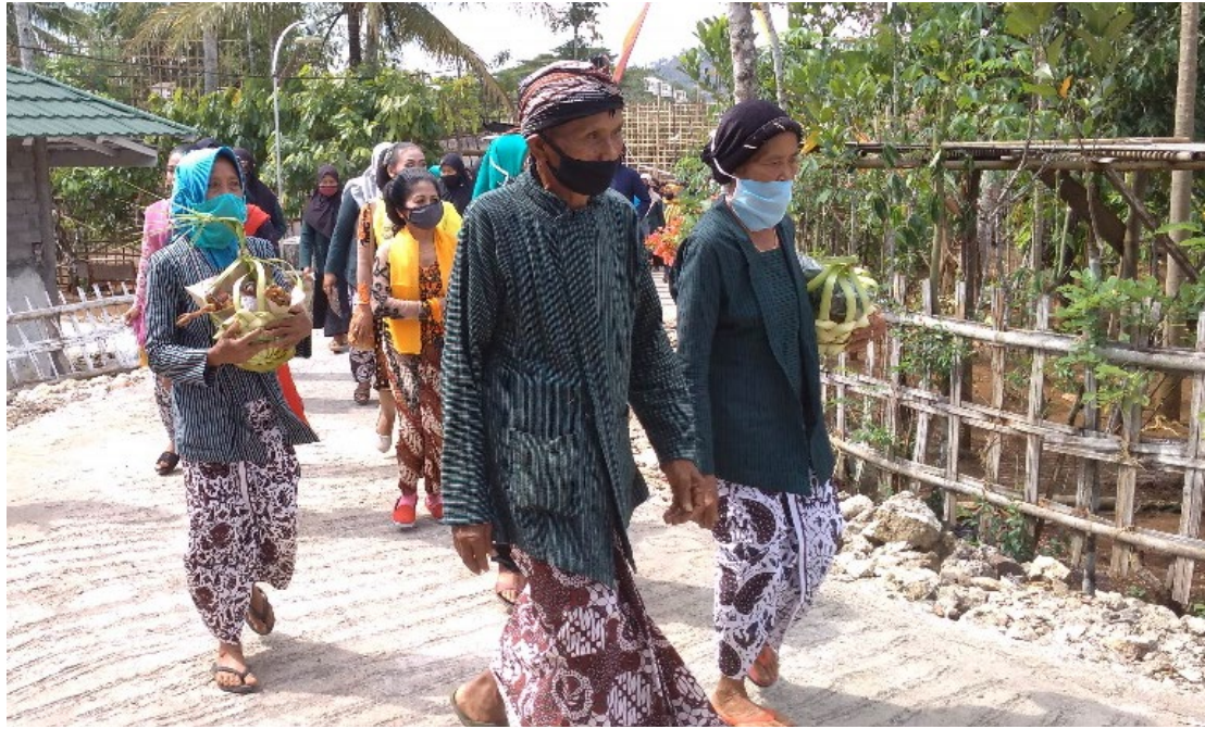
Fig. 4 The bearer of offerings in the procession to the Sendhang Milodo.