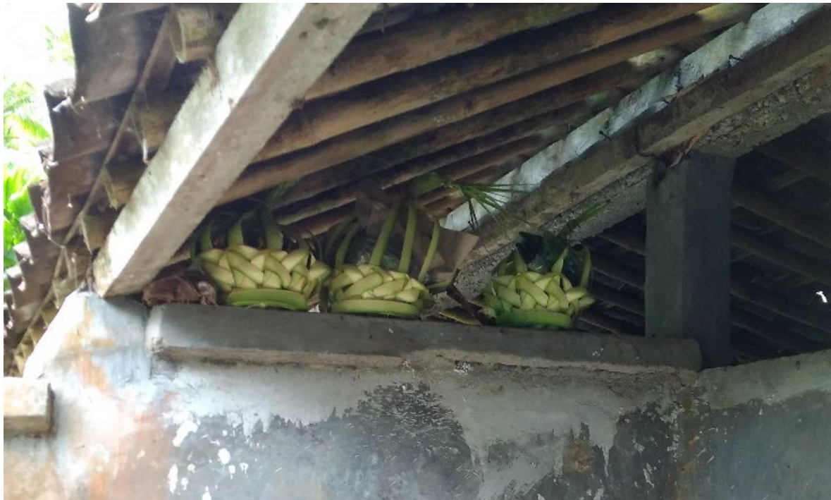
Fig. 8 The offerings brought during the procession are placed on the parapet between the second and third rooms in Sendhang Milodo.

The Sendhang Milodo ritual begins with the laying of offerings by traditional elders. After the procession arrives at Sendhang Milodo, the traditional elders and offering bearers enter the second room, which is south of the third room. The offerings are placed on the dividing wall between the second room and the third room (Figure 8). The offering bearers give the offerings they bring to the traditional elders. After that, they take turns drinking Sendhang Milodo water (Figure 9). According to Prihono (interview 8 October 2020) drinking is an expression of gratitude for the sustenance given, namely the source of water which is very much needed in the life of an agrarian society. At that time, the kendhi brought from Bale Dusun Tukluk was also filled with Sendhang Milodo water. The kendhi , which contains Sendhang Milodo water, will then be brought back to Bale Dusun through a handover process with local leaders (Figure 10). Kendhi and Sendhang Milodo water will