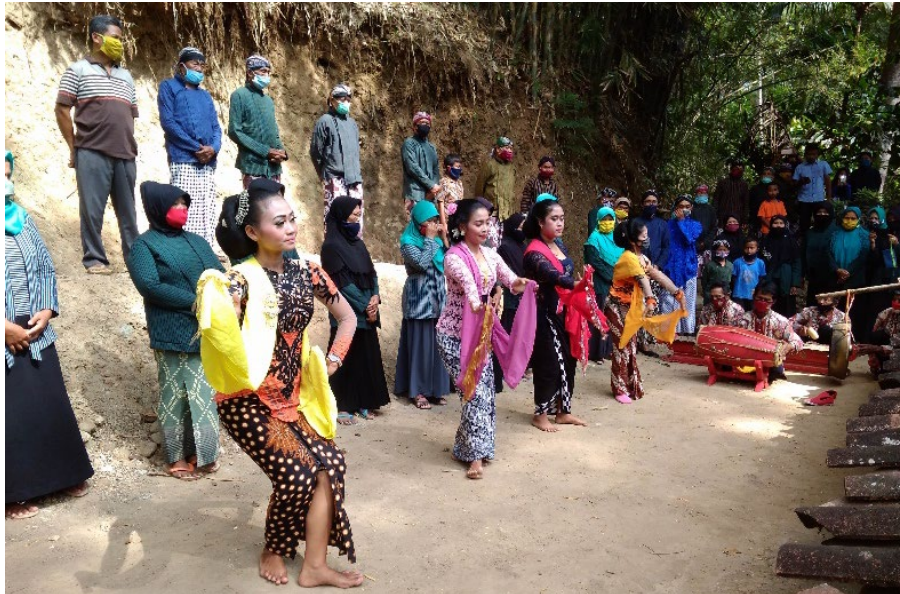
Fig. 13 The first part of the Tayub dance performance at Sendhang Milodo.

The first art of the Tayub dance performance is the Tayuban , which means that the Tayub dancers dance with a female dance movement pattern and are not accompanied by pengibing 4 . The variety of motion used in the tayub section is gambyongan 5 . This initial part can be done with various gendhing (music with gamelan ensemble in Javanese) (Figure 13).