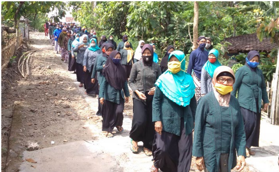
Fig. 5 Participants in the procession to Sendhang Milodo in the Village Purification ritual in Dusun Tukluk, Tambakromo Village.

The total number of participants in the procession from Bale Dusun Tukluk to Sendhang Milodo is approximately 200 people, which is less because of the Covid-19 pandemic – there are usually around 600 people. The village government limited the number of participants taking into account government regulations and participants are also encouraged to keep their distance and keep wearing masks. Young people became a minority in the procession participants while the older group dominated in the procession of the Village Purification ritual at Sendhang Milodo. The