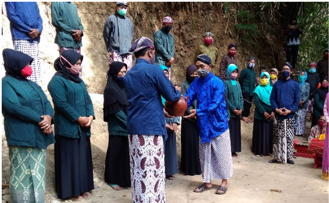
Fig. 10 Handing over a kendhi filled with water from Sendhang Milodo. Source: Photo by R. M. Pramutomo, 2020.

The events above show that water occupies a crucial position in life. Philosophically, Javanese people believe that water is essential to rituals as a repellent, purification, and a source of peace. In