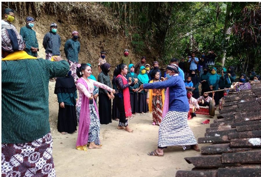
Fig. 14 The janggrungan part of the Tayub dance performance at Sendhang Milodo.

The first art of the Tayub dance performance is the Tayuban , which means that the Tayub dancers dance with a female dance movement pattern and are not accompanied by pengibing 4 . The variety of motion used in the tayub section is gambyongan 5 . This initial part can be done with various gendhing (music with gamelan ensemble in Javanese) (Figure 13).