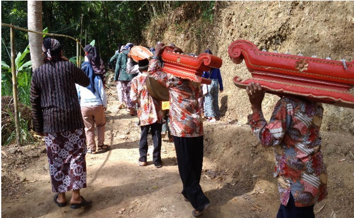
Fig. 6 Villagers carry the gamelan used in the Tayub dance performance at Sendhang Milodo.

elderly have a significant position from starting to bring offerings to becoming one of Tayub 's dancers.