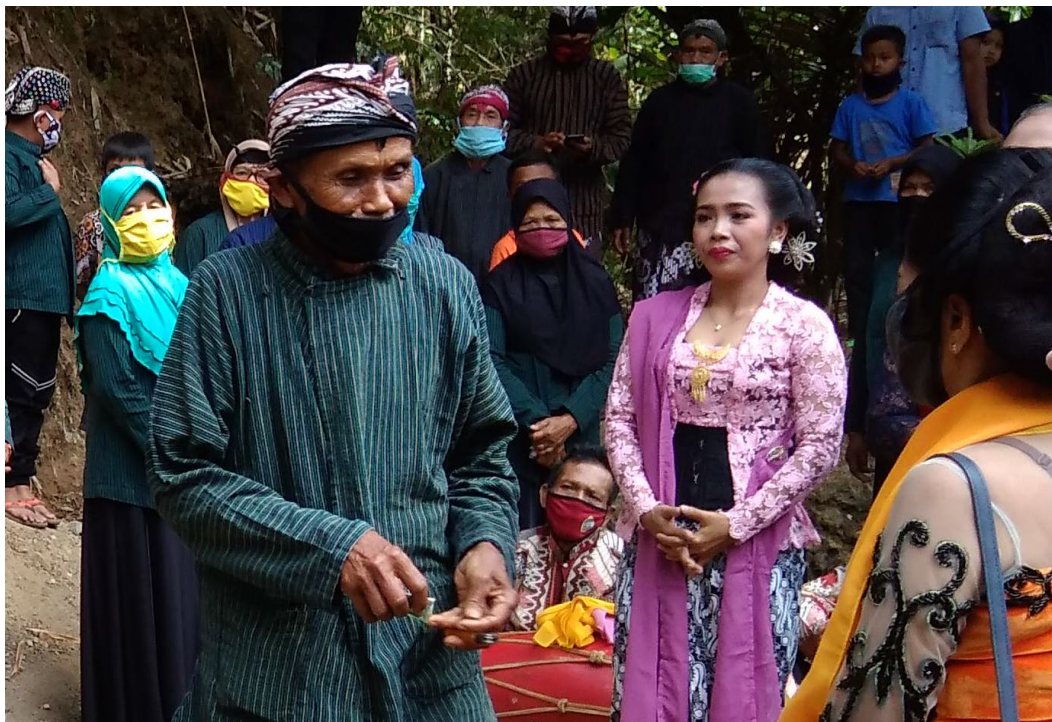
Fig. 12 Traditional elders give money ( saweran ) to senior Tayub dancers to start the Tayub dance performance at Sendhang Milodo.

The normative rules of the presentation structure bind every part of the Tayub dance. The Tayub dance at Dusun Tukluk, Tambakromo Village has three parts, namely tayuban , jangrungan , and bendrongan . The Tayub dance at Sendhang Milodo began with traditional elders giving money ( saweran ) to senior Tayub dancers (Figure 12). Then, after placing offerings and reading the incantation, traditional elders gave money to the senior Tayub dancer. After that, the Tayub players presented the Tayub dance at Sendhang Milodo.