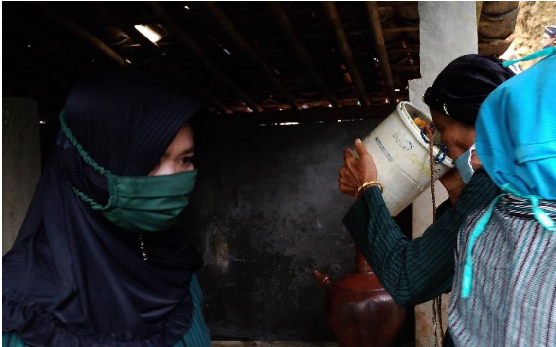
Fig. 9 One of the villagers who bring offerings drinking water from Sendhang Milodo.

complement the main offerings that have previously been arranged at Bale Dusun Tukluk. The traditional elders start burning incense and chanting mantras after the procession of placing offerings and taking water was complete.