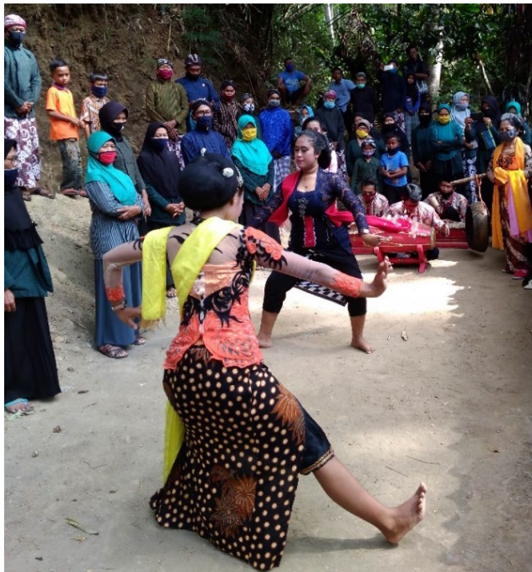
Fig. 15 The bendrongan part of the Tayub dance performance at Sendhang Milodo.

The second part of the Tayub dance performance is janggrungan , or what is often referred to as ngibing (Figure 14). This section begins with a community member who gives the saweran and then asks for a gendhing . In the janggrungan section, community members can dance with Tayub (in Java, it is called pengibing ). Every citizen can ask for a gendhing by giving a saweran . Residents always give saweran to senior Tayub dancers. Local leaders are the top priority for dancing ( ngibing ) with the Tayub dancers and other villagers. Before the Covid-19 pandemic, this section tended to be free with an unlimited duration of presentation depending on whether the audience still wanted to dance or not. As a form of social dance, in the janggrungan section, physical contact is the main feature. The pengibing (audience) when dancing or giving money is allowed to touch any part of the dancer's body. Therefore, due to the Covid-19 pandemic, the janggrungan section has experienced a significant reduction in the duration of the presentation, which is limited to two gendhing . Helpers are encouraged to keep wearing masks and keep their distance to avoid physical contact.