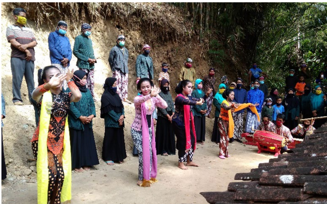
Fig. 11 Tayub dance performance at Sendhang Milodo.

Sendhang Milodo became the location chosen by the residents of Dusun Tukluk, Tambakromo Village, as the place for the Tayub dance to be held in the Village Purification ritual. Sendhang Milodo is a groundwater source that has the closest distance to Dusun Tukluk. It should be remembered that an agrarian society highly respects sendhang as a source of life. Water is one of the basic needs that support life (Firmansyah 2013: 5; Dwimarwati and Djuniarti 2017: 330–338; Suparta 2021: 57–59). This is what makes Sendhang Milodo a purified or sacred place. In addition, Mbok Roro Pithi is an ancestor that the residents of Dusun Tukluk believe resided in Sendhang Milodo. This is the basis for choosing the Sendhang Milodo as the venue for the Tayub dance performance in the Village Purification ritual. The purpose of holding the Tayub dance in the Village Purification ritual is as an expression of gratitude for the grace given by God through the Sendhang Milodo (Prihono interview 8 October 2020).