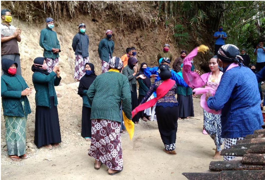
Fig. 16 The atmosphere of togetherness in the Tayub dance performance at Sendhang Milodo.

The movement patterns used in the Tayub dance in the Village Purification ritual in Tambakromo are aesthetically uncomplicated. This is indicated by the absence of normative rules that bind the motion patterns used, especially in the janggrungan section, where everyone is allowed to dance with an unspecified movement pattern. Like the Village Purification ritual dance in general, aesthetic presentations are not given much attention but prioritize interests or goals (Lupitasari 2019: 371). This shows that Tayub dance as a form of social ritual dance is vigorous. Social interaction between citizens can provide a picture of togetherness that can be used as a form of relationship (Figure 16).